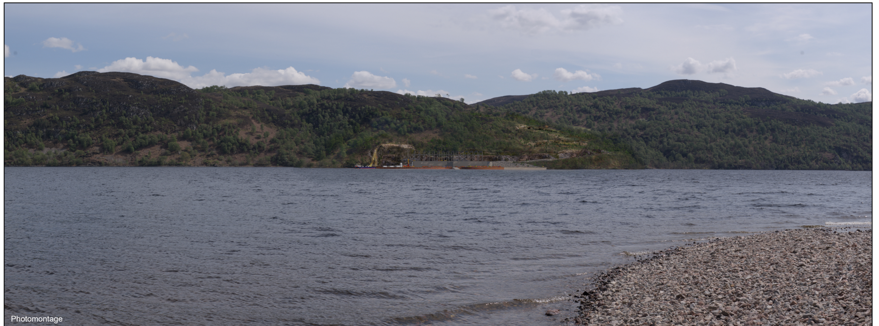
Figure V3b-1c Visualisation Location 1: In the vicinity of the A82 north of Invermoriston - Photomontage- Year 3 of Construction

OS reference: 244688 E 817533 N Distance to proposed Scheme: 0.18 km Groundlevel: 15m AOD Direction of view: 142° Camera: Sony ILCE-9 Focal length: 50mm vertical (27°) x 28mm horizontal (65.5°) Camera height: 1.5m Date:13/05/2023 Time: 14:08