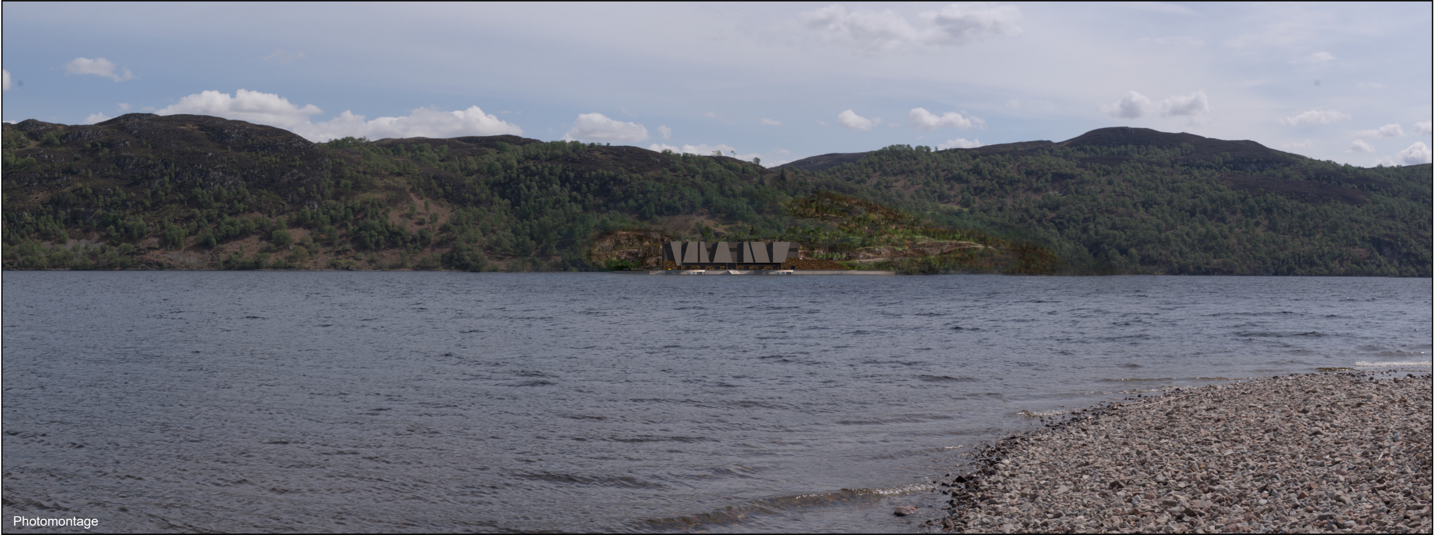
Figure V3b-1d Visualisation Location 1: In the vicinity of the A82 north of Invermoriston - Photomontage- Year 1 Post Completion

OS reference: 244688 E 817533 N Distance to proposed Scheme: 0.18 km Groundlevel: 15m AOD Direction of view: 142° Camera: Sony ILCE-9 Focal length: 50mm vertical (27°) x 28mm horizontal (65.5°) Camera height: 1.5m Date:13/05/2023 Time: 14:08